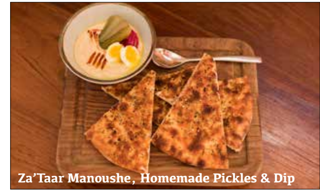
Za'Taar Manoushe, Homemade Pickles & Dip