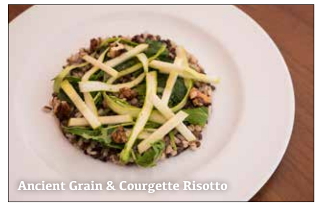
Ancient Grain & Courgette Risotto